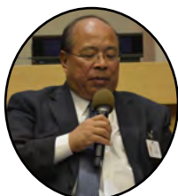
H.E. Mr. U Thaung TUN

Union Minister, Ministry of Investment & Foreign Economic Relations, Myanmar