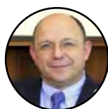
Mr. Thomas Gass

Minister of Finance, Government of the People's Republic of Bangladesh