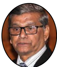
H.E. Mr. M. Abdul MANNAN Minister of Planning, Bangladesh

'Effectiveness and the SDGs are highly interdependent. We cannot achieve any of them alone.'