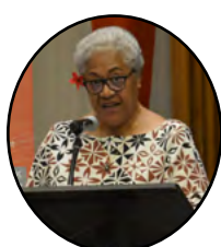
Hon. Fiame Naomi Mata'afa

Deputy Prime Minister, Member of Parliament, Samoa