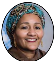
Ms. Amina J. MOHAMMED

Deputy Secretary-General, United Nations