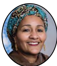
Ms. Amina J. MOHAMMED

'The traditional approach to development will not bring the SDGs to life. We need to put in place a real paradigm shift in terms of ambition, scale and speed to match the 2030 Agenda.'