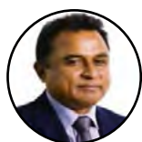
Mr. Mustafa Kamal

Minister of Finance, Government of the People's Republic of Bangladesh